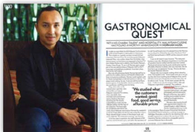
Prestige Magazine Malaysia's Top 40 Under 40 List 2010.